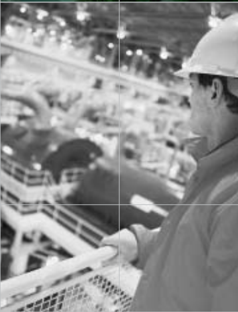
Above Middle Ronald Reagan Presidential Library, Air Force One Pavilion, Simi Valley, CA Above Right Yale University, New Haven, CT Above Far Right Bristol-Myers Squibb Company, Lawrenceville, NJ