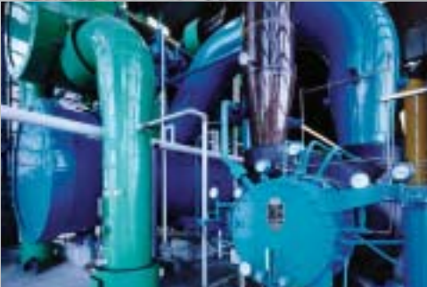
Top Chandler Regional Medical Center, Chandler, AZ Middle San Diego Convention Center, San Diego, CA Bottom The Massachusetts Institute of Technology, Cambridge, MA

Our 75-plus years of experience includes professionals who are passionate about the business of energy and how they can make it work better for you. Predictably. Efficiently. Reliably.